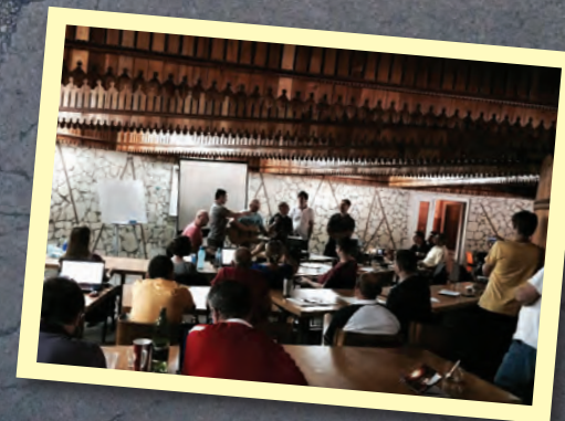
STUDENTS AT UKRAINE BIBLICAL SEMINARY

Please keep these students in your prayers as they continue their studies. If you would like to support the education of pastors in Russian-speaking countries, please visit thirdmill.org/donate and click on the Russian panel.